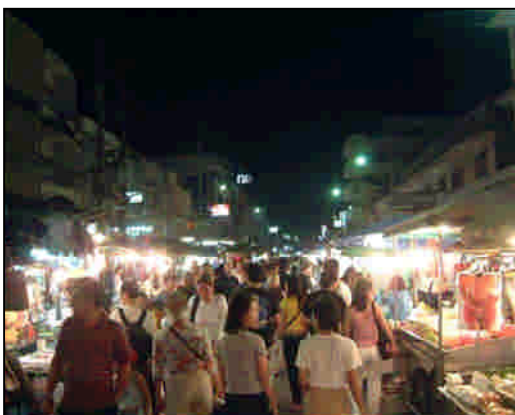
Night market - Hua Hin town

Hua Hin Beach is one of Thailand's greatest beaches and the King of Thailand has his summer palace Klai Kang Won (which translates as 'away from tension') nearby.