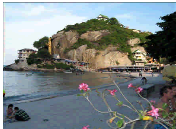
Hua Hin beach