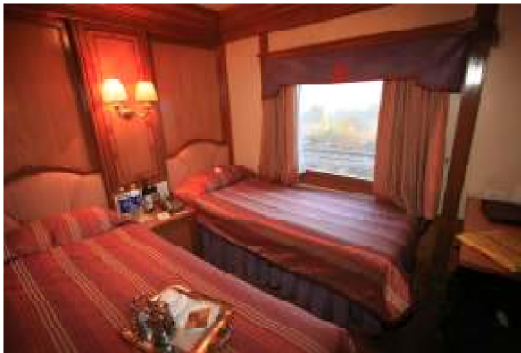
Deluxe cabin – twin bed

General facilities include two restaurant cars and a bar coach with a Foreign Exchange facility. There is also a Health/Spa Coach where you can enjoy a Massage, Steam Bath, Gymnasium and Beauty Parlour. There are also additional coaches for luggage, power generators and staff accommodation.