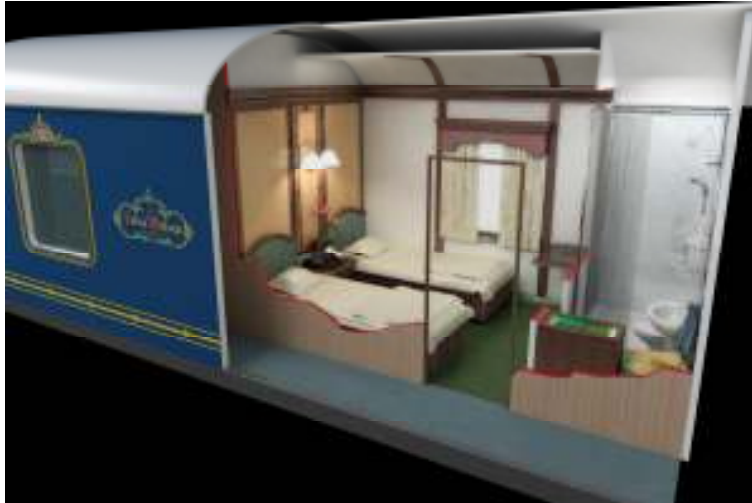
Deluxe cabin – cut away view